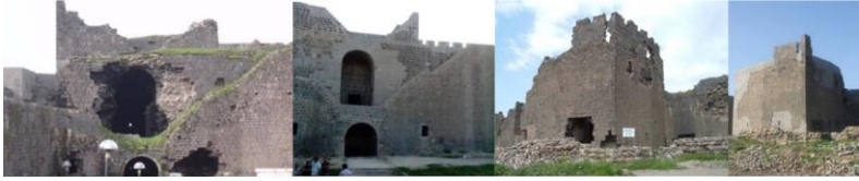
Figure 1: Restoration of Fortresses, Before- After (26th Buttress and 47th Buttress)