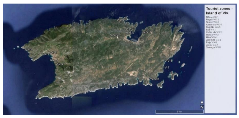
Figure 1: Map of analyzed tourist zones on the island of Vis

For research purposes were analyzed isolated tourist zones provided in the spatial plans for the island of Vis<sup>2</sup>. On the island of Vis is analyzed a total of 13 tourist zones which contain any form of cultural or natural heritage. The zones are numbered and mapped in the Figure 1 and classified as following in the Table 1.